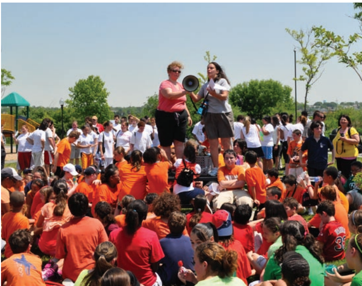
Students, parents and staff raised over $5,000 for classroom needs during spring walk-a-thon. To date we have raised $40,000 toward our goal of $216,000.

ANY AMOUNT YOU GIVE WILL MAKE A DIFFERENCE!!!